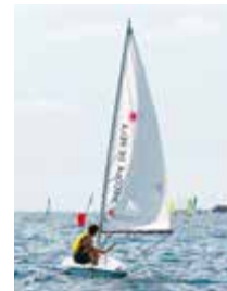
Improvement Laser / RS Quest Schedules: 10 to 12h or 12 to 14h