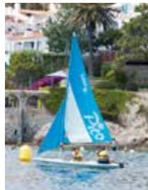
Advanced Laser Pico / RS Zest Schedules: 9.30 to 11.30h or 11.30 to 13.30h