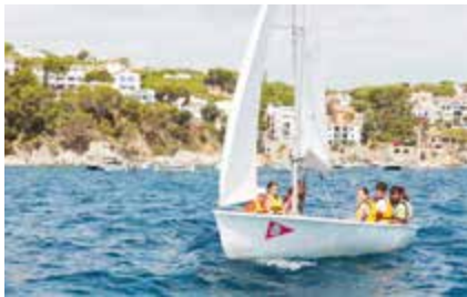
Beginners I & II Gamba Schedules: 9.30 to 11.30h or 11.30 to 13.30h